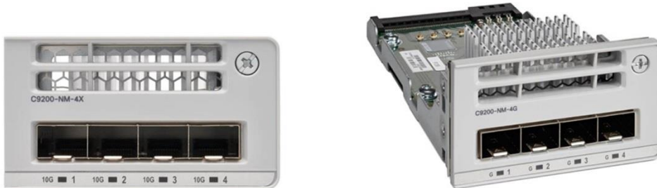
Figure 2. Cisco Catalyst 9200 Series Switch network modules

Cisco Catalyst 9200 Series switches come with modular or fixed uplinks as indicated in Table 1. With modular SKUs, the field-replaceable network modules provide infrastructure investment protection by allowing a nondisruptive migration from 1G to 10G and beyond. When you purchase the switch, you can choose from the network modules described in Table 2.