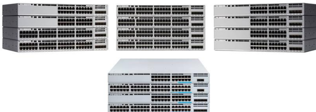
Figure 1. Cisco Catalyst 9200 Series switches

The Cisco Catalyst 9200 Series is made up of modular (C9200) and fixed (C9200L) switch models.